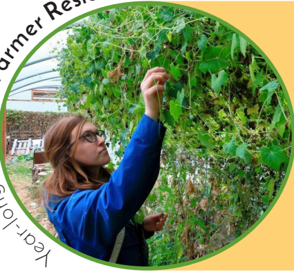
Aspiring Farmer Residency Year-long

For one year, individuals work as a team to manage the Big Muddy Urban Farm's market farm operation in exchange for housing. Aside from growing food, each individual learns how to manage crops, build a business and host community events.